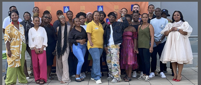
Twenty-five mentees have embarked on their journey of training in the fashion industry, with the goal of becoming industry experts.

This year’s programme is centered on building sustainable careers in fashion, fostering entrepreneurial success, and preparing mentees for the realities of the industry. By the end of the programme, the mentees will have the